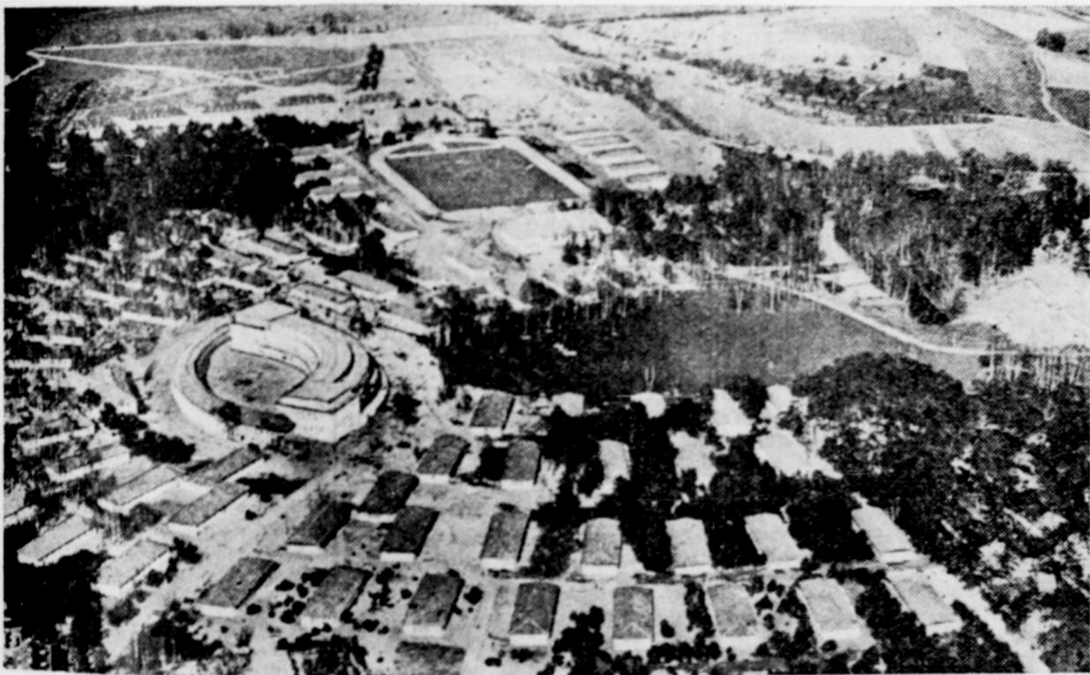
An aerial view of the Olympic village which has been completed on Berlin's outskirts, where the athletes from all over the world will be housed during the forthcoming Olympic games.