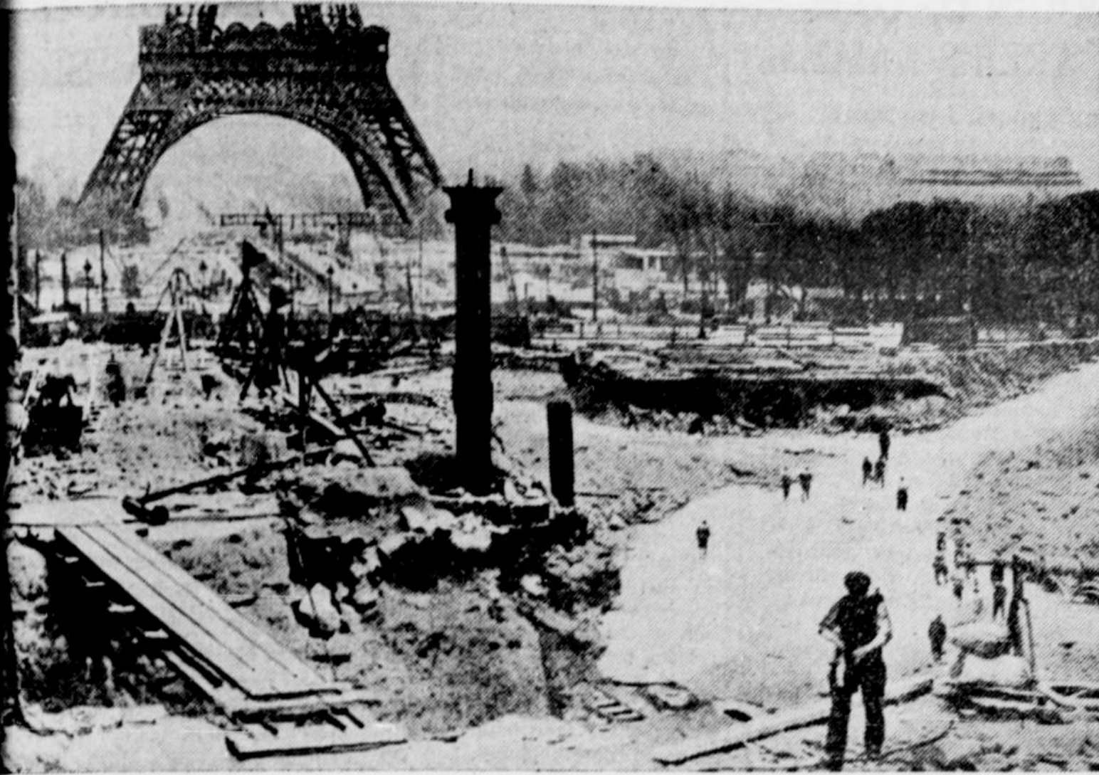
There is going to be a big exposition in Paris, France, in 1937, which is likely to attract many Americans. It will be built on the ground shown in this picture, the site where the Trocadero formerly stood. In the background is seen the base of the Eiffel Tower.