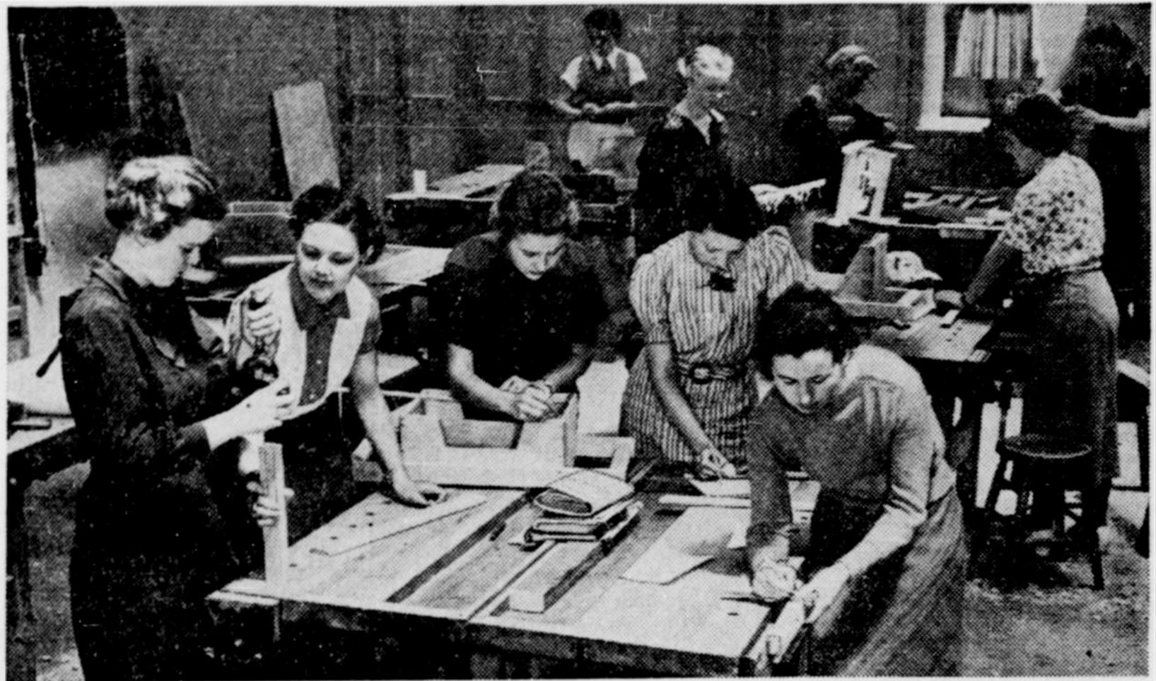
As further indication of the invasion of women into what has heretofore been considered the realm of men, fifty co-eds at the University of California at Los Angeles are taking a course in carpentry. The girl students pictured above during class will be able to qualify for work with hammer, saw, drill or chisel, when the need for a handy man around the house arises.