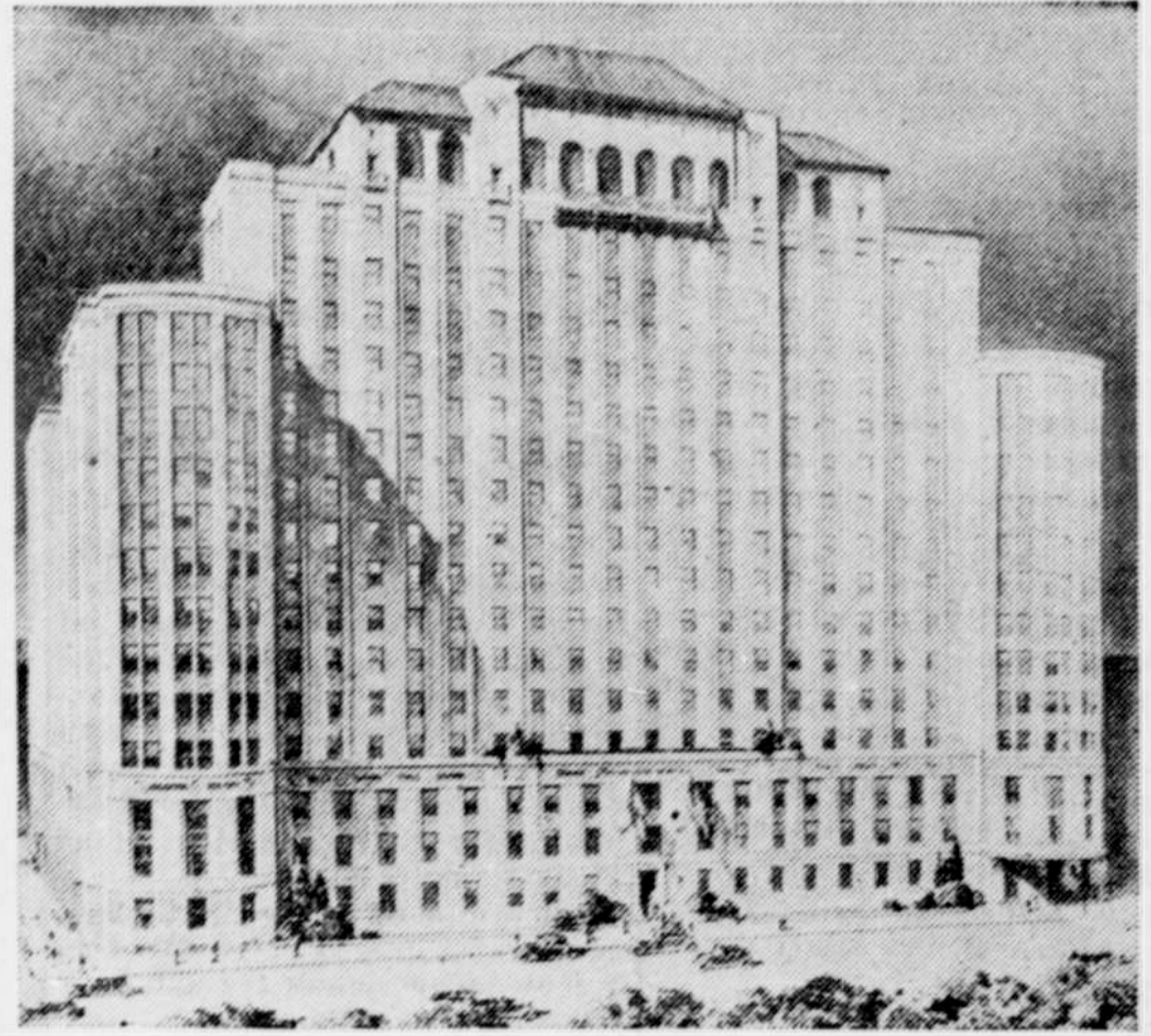
This is an architect's drawing of the proposed Pan-American Post-Graduate hospital which will be constructed in New York at a cost of about $7,000,000 and which will be ready for occupancy in 1938. Similar structures will be built in Central and South America. The New York institution will be the first of its kind in this country and will have on its staff students, physicians and surgeons from Latin-American nations.