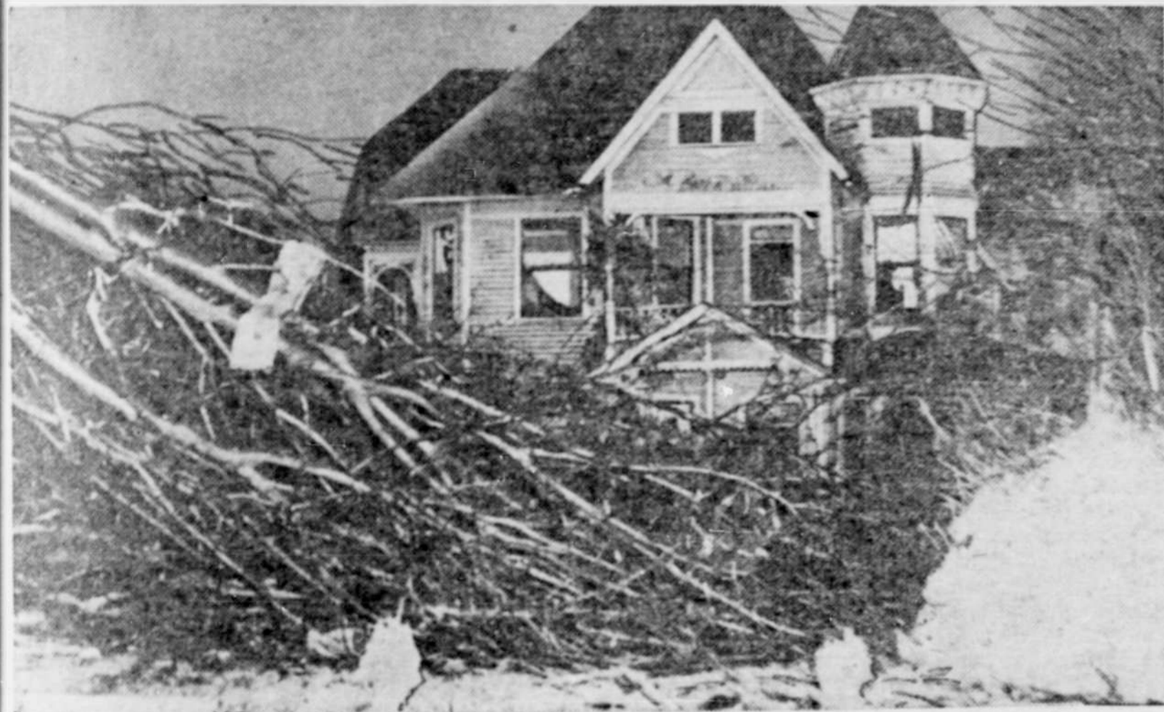
View in Tupelo, Miss., after the tornado that practically ruined the little city and killed nearly 200 of its inhabitants. The same storm swept across six southern states and the death list reached almost 400.