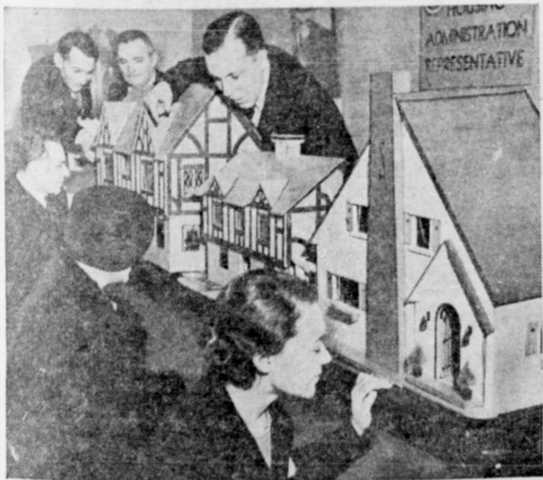
The Federal Housing administration is trying out a new idea in Chicago, an insured mortgage clinic to help prospective home buyers in making a choice. Model houses are shown the buyers, builders and loaners and are explained by FHA officials.