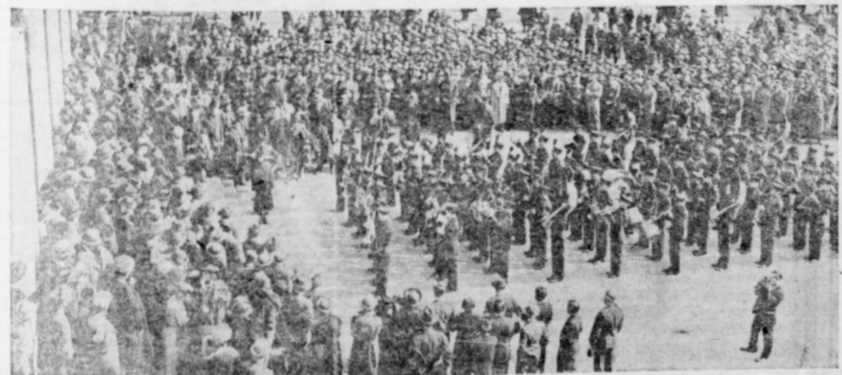
The Township High School band of Joliet, Ill., six times winner of the national school band championship visiting New York, serenaded Mayor La Guardia at the city hall.