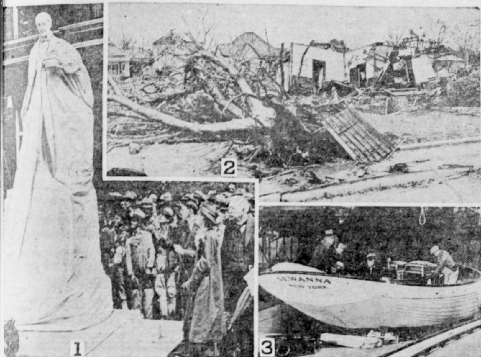
1—Statue of Dr. Crawford W. Long, discoverer of the anesthetic qualities of ether, being unveiled at his birthplace, Danielsville, Ga., by his daughter and great-grandson. 2—Wreckage left in Cordele, Ga., by a recent spring storm. 3—Workmen at Fair Haven, Mass., fixing up the schooner Sewanna which has been chartered by President Roosevelt for the summer.