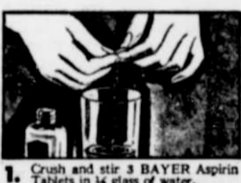
1. Crush and stir 3 BAYER Aspirin Tablets in 1/2 glass of water.