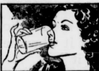
3. If you have a cold, take 2 BAYER Aspirin Tablets. Drink full glass of water. Repeat if necessary, following directions in package.

Modern Scientific Method Wonderfully Easy