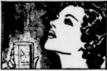
2. Gargle Thoroughly—throw your head way back, allowing a little to trickle down your throat. Do this twice. Do not rinse mouth.