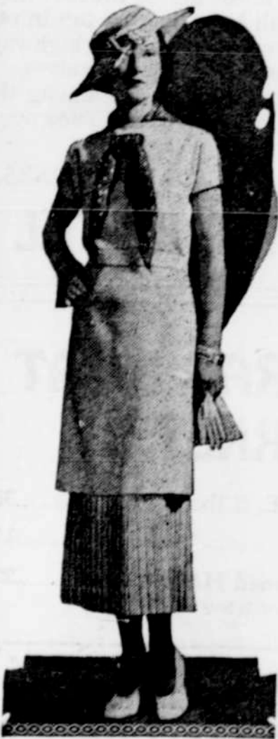
This attractive tunic dress for afternoon is of powder blue silk linen. It buttons down the back and has a sheer navy blue scarf.