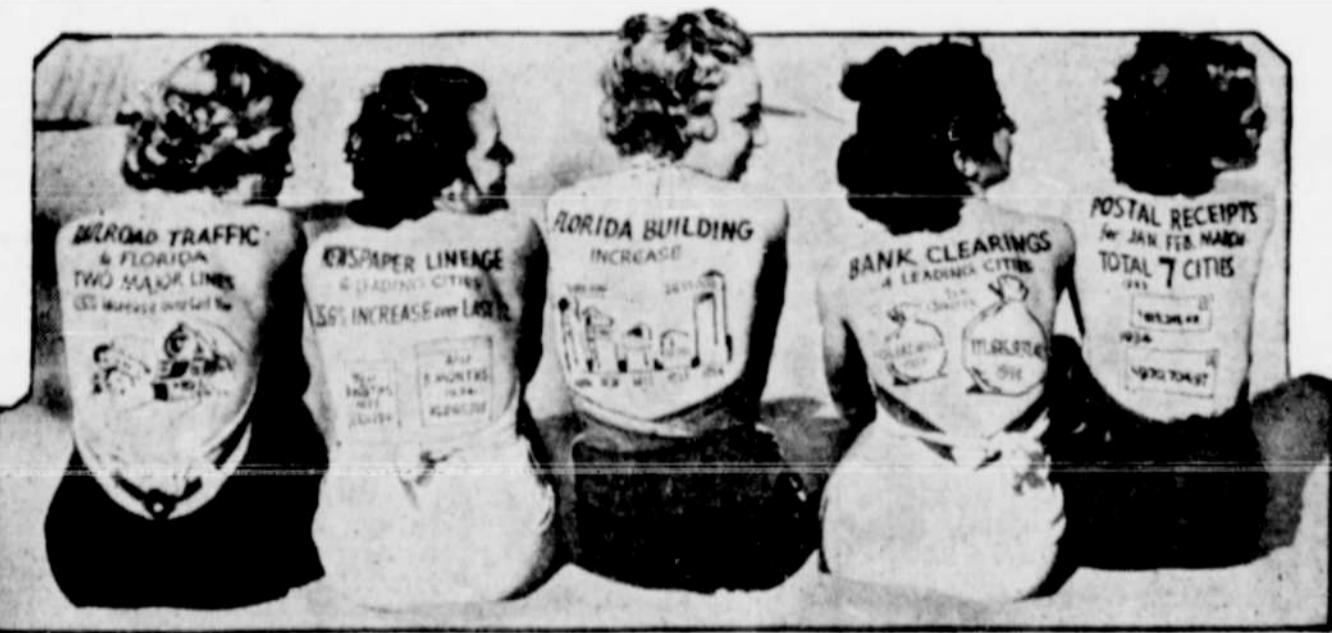
The people of Florida are justly proud of the rapid strides their state is making on the highway that leads back to prosperity. Just so the figures will not be boring, they are presented, with lines and charts, at Coral Gables as shown above.