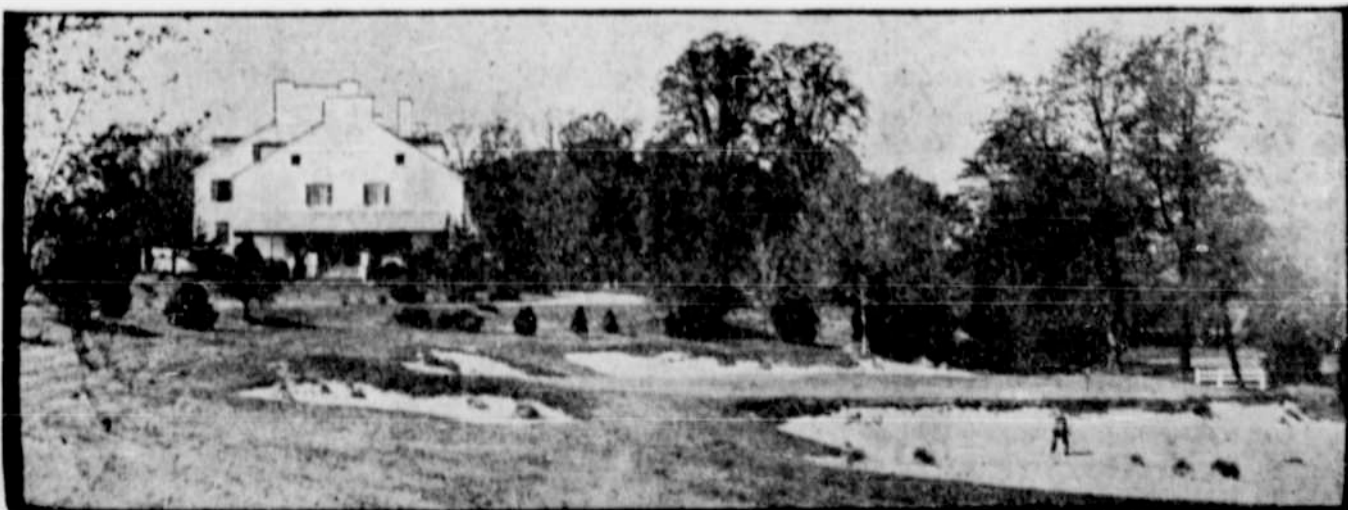
View of the thirteenth hole and the clubhouse of the Merion Cricket club, South Ardsmore, Pa., where the national open golf tournament will be played in June.