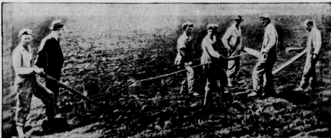
Convicts in Arkansas have been used instead of mules for pulling planting machines on the state penal farm, as shown in this photograph. The work was not harmful, but protests led Governor Futrell to order it discontinued.