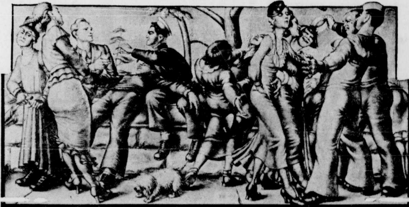
It took only one look from Secretary of the Navy Claude Swanson, Assistant Secretary Henry L. Roosevelt and an assortment of rear admirals, captains and commanders to send this work of art into the darkest corner of the navy's brig. It is entitled "The Fleet's In," and depicts a scene on shore when the navy boys greet their feminine admirers. The work of a CWA artist, Paul Cadmus, it was labeled as being "not true to the navy" by Mr. Swanson.