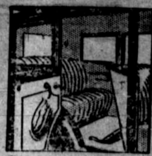
Wide doors open upon spacious rear compartment. Beautifully finished and fitted doors. Inlaid mahogany panels. Quiet Latin Ford motor.