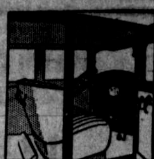
Indirectly lighted around panel with inlaid mahogany, mahogany, mahogany, mahogany, mahogany. Cushions in deep crease.