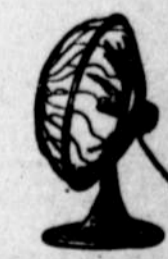
This Edison Red-lite electric heater given with every Thor before November 1st.

Prove for yourself just how a Thor will wash everything from fluffy "underalls" to heavy overalls, how it will save you time and money. Let us do your washing for you. No obligation. You are the sole judge of whether it will help you, make your work lighter. But don't delay. Our special purchase plan expires November 1st.