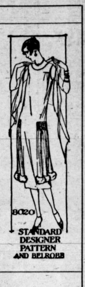
STANDARD DESIGNER PATTERN AND BELLOBB

These are real Bargains. Some that we wish to close out quickly and have marked at a price that should accomplish this end. Let us show you $4.98 Your choice while they last.... $4.98