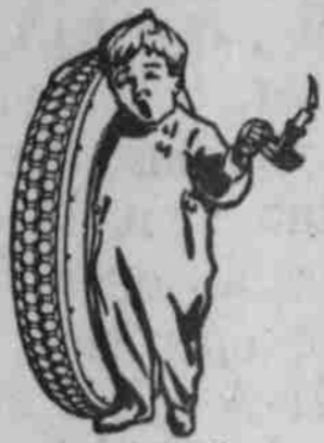
Time to Re-tire?