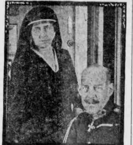
KING AND QUEEN OF GREECE