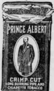
Prince Albert is sold in tippy red bags, tidy red tins, handsome pound and half pound tins, humidors and in the pound crystal glass humidors with sponge moisture top.

Ever roll up a cigarette with Prince Albert? Man, man—but you've got a party coming your way! Talk about a cigarette smoke; we tell you it's a peach!