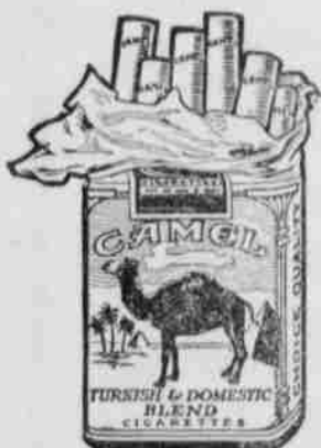
R. J. REYNOLDS Tobacco Co. Winston-Salem, N. C.