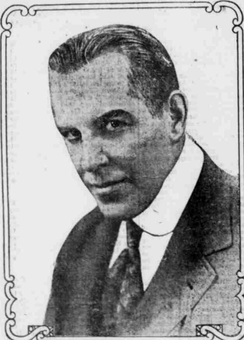
HARRY T. MOREY

When not at work on a picture Harry T. Morey is to be found in No. 16, a dressing room which dates back to the early days of his career in the Brooklyn studio of Vitagraph. It was 10 years ago that he occupied this room with Earle Williams. The walls resemble a combination of art museum and rogues' gallery. They are hung with pictures of Morey in various roles, ranging from a policeman, his first part; the crook, Joseph Garson of "Within the Law," to the high financier in "The Gamblers." Recently, he has added Philip Grey in "The Birth of a Soul" and a detective character in "The Flaming Claw."