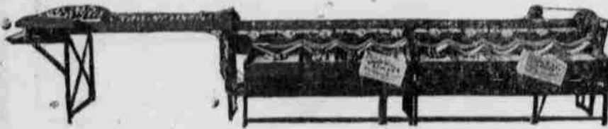
Side view of Two Section Model for small growers

On account of the difficulty of obtaining delivery of material, we strongly advise growers to place their orders early for