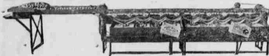
Side view of Two Section Model for small growers

On account of the difficulty of obtaining delivery of material, we strongly advise growers to place their orders early for