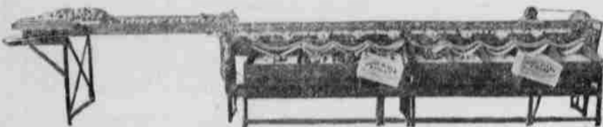
Side view of Two Section Model for small growers

On account of the difficulty of obtaining delivery of material, we strongly advise growers to place their orders early for