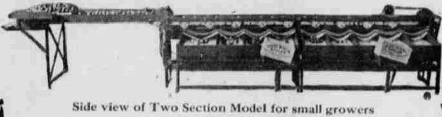
Side view of Two Section Model for small growers

On account of the difficulty of obtaining delivery of material, we strongly advise growers to place their orders early for