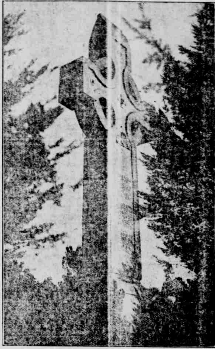
The historic "Prayerbook Cross," in Golden Gate Park, San Francisco, which shortly is to be consecrated by the Protestant Episcopal Church as its first shrine.