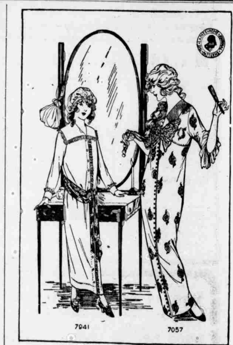
WITH NOTHING TO MAR THEIR CHARMING SIMPLICITY

Nothing is quite as dear to the heart of woman as the dainty negligee into which she slips with such a feeling of luxury in the confusion of her own room. She may revel in its supple fabric, its soft colorings and the grace of its frills and flounces with never a misgiving as to its suitability, for it is one garment that may be as plain or as fussy as the fancy desires without losing its charm. Printed silks or cotton crepes with quaint, impossible flowers or old fashioned looking designs sprinkled here and there are admirably suited to negligees, and the plain crepes and mulls are dainty, too, offering possibilities for frills and flounces galore. 7957 is a pretty empire model, depending upon graceful lines and the oddly patterned material for effect rather than more elaborate trimmings. The lace butterfly across the front is one of those attractive trifles, quickly and easily made, that do so much to make a garment distinctive. To make this model in size 36 it requires 4 1/2 yards of 36 inch material. No. 7941 is a design that, made up in a softly tinted albatross or eiderdown trimmed with tiny frills of net or ribbon and sashed in a vivid Futurist silk, would bring joy to the boarding school girl. It would also be pretty in a silk or crepe. Three and three-quarter yards of 36 inch material is needed to copy 7941 in size 10.