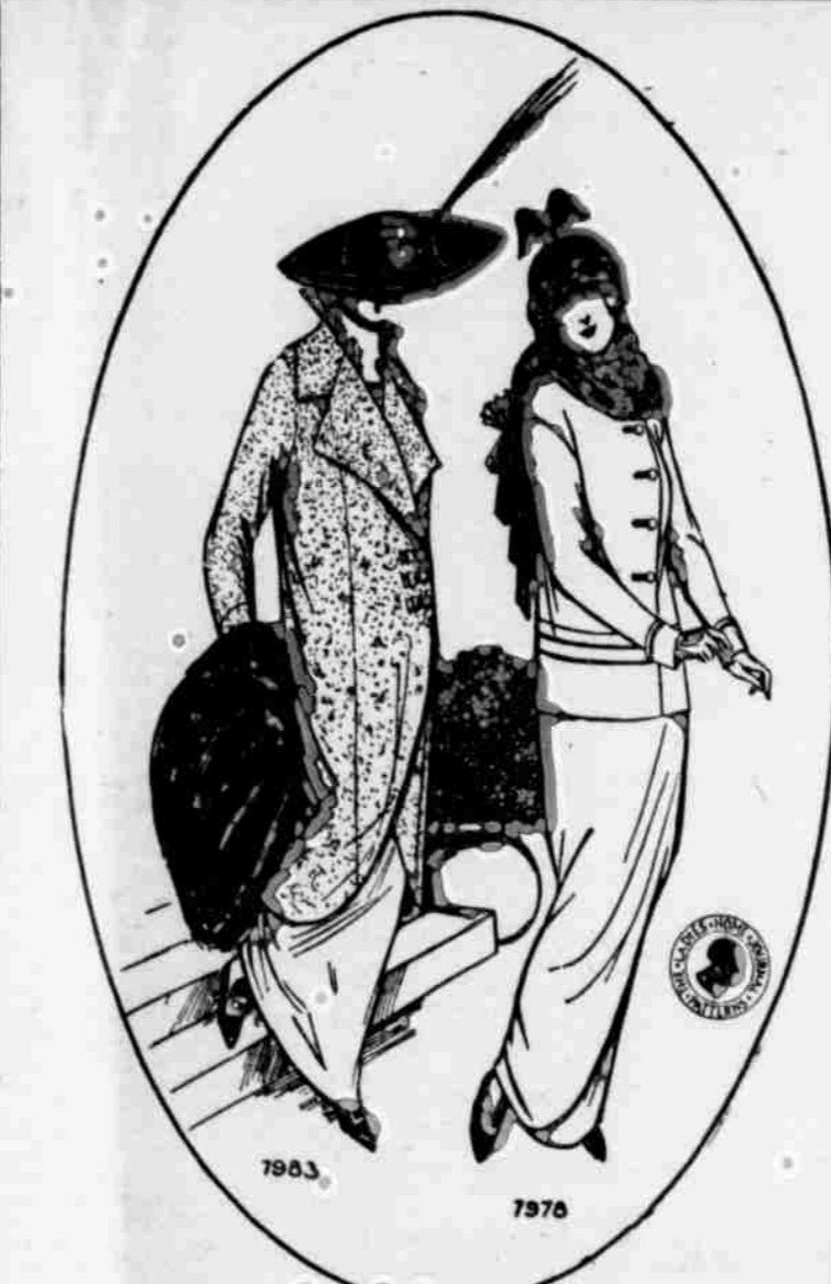
HERE WE NOTE THE DROP SHOULDER ON A COAT

Essentially plain and straight of line, the separate coat must be smart of cut. For trimming it depends more or less upon an oddly shaped revers, an attractive cuff and belt. The novelty fabric, in which many of these coats are made, are in themselves decorative, and few trimmings are required. Twos in new mixtures effectively relieved by plain materials, ratines, velours de laine and the new fur fabrics, by the way, are some of them so much like the real skins that it is difficult to tell the difference. They are light, supple and warm. One of them—broadtail, for instance—could be used with 7983 very appropriately. Here ratine was used with cuffs, collar and revers of broadtail satin. To copy in size 36 1/4 yards of 42 inch material will be needed with 1/4 of a yard of broadtail. There is something very attractive about the lines of 7978. It resembles closely a suit of Potret, made of bright blue velours de laine with trimmings of black silk braid and touches of scarlet, the buttons were centered with scarlet. The drop shoulder effect, the low belt and the turndown collar are modish and distinctive. 3 1/4 yards of 36 inch velours de laine with 5 yards of braid will be needed to make in size 36. No. 7982—sizes 34 to 46. No. 7978—sizes 34 to 42. Each pattern is 15 cents.