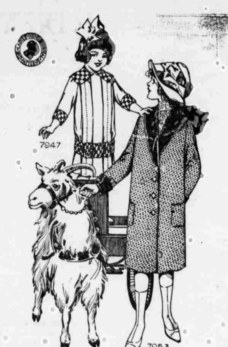
SMART COATS AND DRESSES FOR TINY TOTS

If tiny tots do not have their new fall coats designated as "sport coats," like their grownup sisters, they look just as smart and happy when seen playing in Central park. Just a half hour there on a bright morning will make one acquainted with these fascinating miniature fashion plates, from whom the busy mother can get ideas for the clothes she must make. Here are two sketches of stylish and warm full length models for children. The younger child has on a one-piece plaid dress (7947) in a serviceable beige color poplin with a deep collar and cuffs of brown and white check silk, which is also used for the belt. It is a warm dress to be worn without a coat on mild days. For a child of six years 2 1/4 yards of 42 inch material will be sufficient. The pattern is cut in four sizes and costs 15 cents. Soft and beautiful in texture, but light in weight, is the mixed tweed used for the older girl's long coat. It has a straight one-piece back and coat sleeves. The shawl collar and cuffs are made of one of the latest kinds of trimming plush in seal brown. This pattern will require 1 1/2 yards of 64 inch goods for the coat and 1 1/4 of 24 inch plush. The coat is cut in five sizes. Fifteen cents.