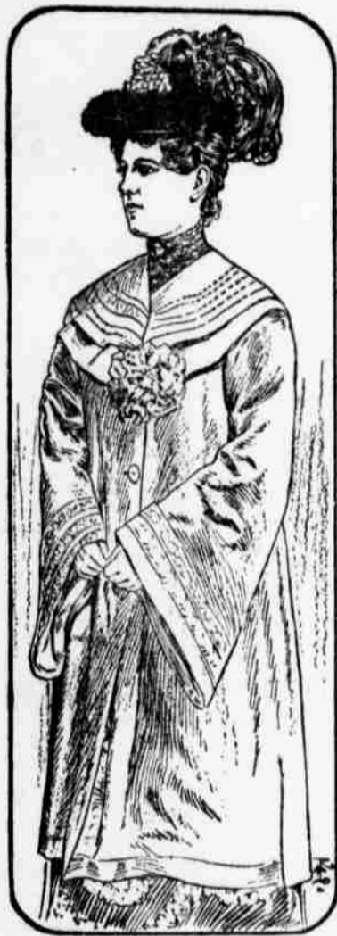
MRS. JAN KUBELIK.

Twenty-seven years ago the poor Bohemian market gardener Kubelik, to whom a son had just been born, would have called insane anybody who predicted that the baby would have to marry into the most exclusive aristocracy in Europe. In his part of the world music is the supreme art, and it seemed natural that the king of modern violinists should wed Countess Mariane Czaky, daughter of one of those ancient Bohemian houses that trace their origin further back than any other aristocracy in Europe. Kubelik was but twenty-three years old at the time of his marriage, and the