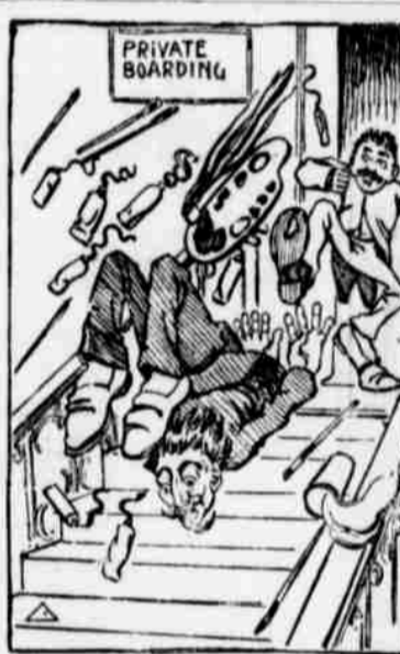
"Coming out with flying colors."—New York World.