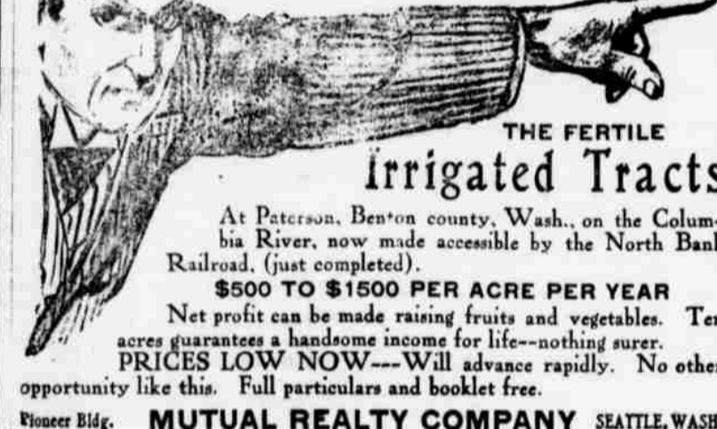
THE FERTILE Irrigated Tracts

At Paterson, Benton county, Wash., on the Columbia River, now made accessible by the North Bank Railroad, (just completed).