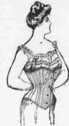
AMERICAN BEAUTY STYLE 302 Kalamazoo Corset Co. Sole Makers

Our line is the very best for the money asked that anyone can show. Our all wool Men's Suits at $10.00 are strictly all O. K., and our Fancy Worsteds at $12.00 to $17.50 are better goods and better made than what other people are asking $15.00 to $20.00 for. You stand in your own light if you don't see our clothing for Men, Boys and Children before you buy elsewhere.