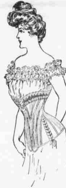
AMERICAN BEAUTY Style 103 Kalamazoo Corset Co. Sole Makers