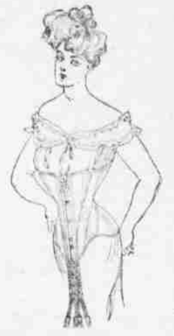
Made by Kalamazoo Corset Co. Also Sole Makers of American Beauty and F. C. Corset. Style 103

Are the equal of any of the big department stores that sell for $1.75 to $2.50.