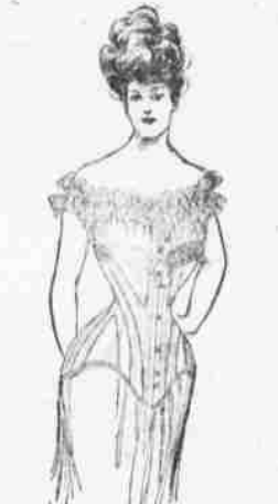
AMERICAN BEAUTY STYLE 316 Kalamazoo Corset Co. Sole Makers