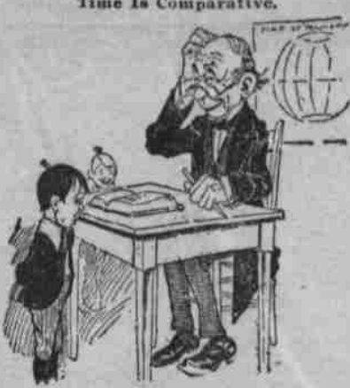
Teacher—Charles, what is the shortest day of the year? Charles (from experience)—The day your father promises to give you a licking before you go to bed.

Age of Responsibility. In England the law looks upon every one over the age of 7 as a responsible being, and every child beyond that age can be prosecuted as a criminal. The same age is accepted in Russia and Portugal. In France and Belgium the age is 8, in Italy and Spain it is 9. Norway, Greece, Austria, Denmark and Holland decline to prosecute a child under 10, and this is the rule also in some of the Swiss cantons. In Germany the limit of responsibility is fixed at 12.