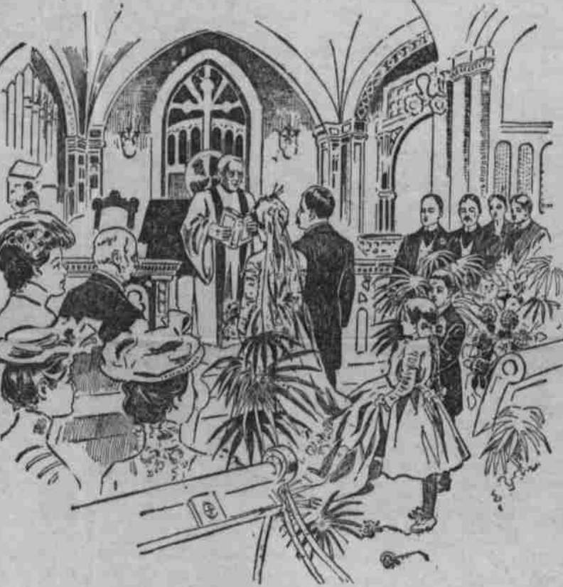
CHURCH WEDDINGS ARE NOW OUT OF DATE.