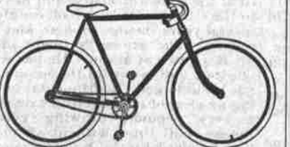
Columbia Model 49, $40.

POPE MANUFACTURING CO., Controlling Oregon, Washington, Montana and Idaho.