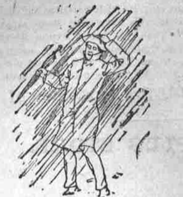
In all Sorts of Weather.

He suffered for over 20 years, and the last decade has suffered so much that he was unable to do any work. To this the frequent occurrences of dizzy spells were added, making him almost a helpless invalid.