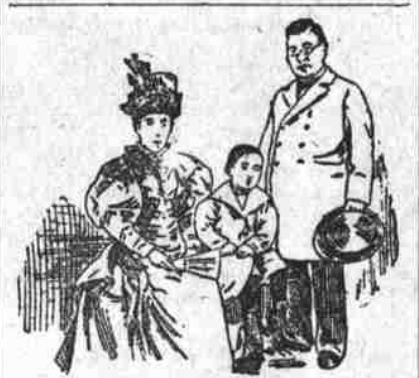
JAPANESE MINISTER AND FAMILY.