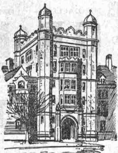
PHILIPS MEMORIAL GATEWAY AND HALL.

The pride of Yale will be the Phelps memorial gateway and hall, now being built, which will be completed about the 1st of January next. The gateway will form the main entrance to the campus, and will complete the Yale quadrangle, which will henceforth be inclosed, much after the fashion of the English universities. The new structure will fill an immediate and urgent need of more recreation rooms and carries out the idea that has lately been gaining favor at New Haven of inclosing the campus. Iron railings will be constructed between the dormitories on the campus which are not contiguous, and the entrance to Yale's classic precincts will be somewhat formal and subject to inspection from a porter or gatekeeper. The Phelps memorial will be an attractive structure, the highest building