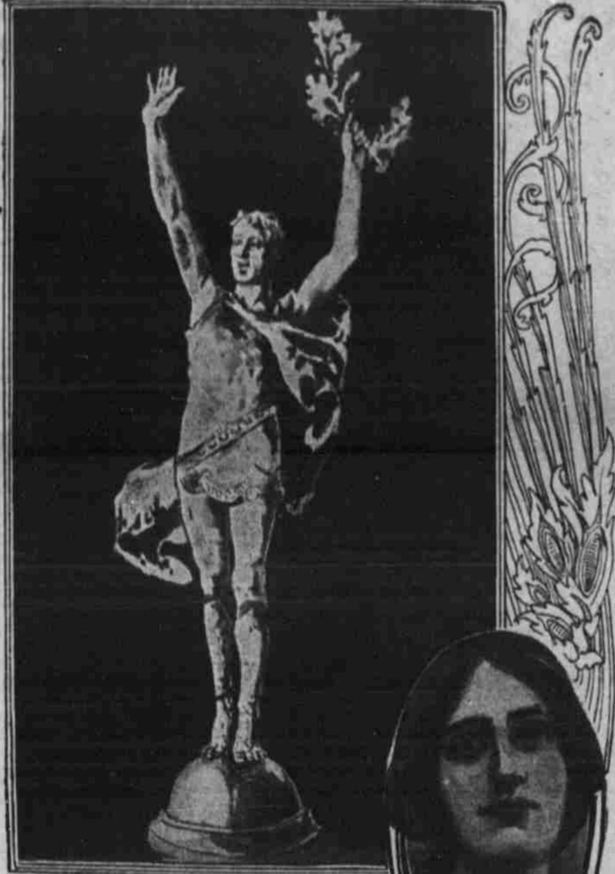
MISS LONGMAN'S STATUE OF "VICTORY" AT THE CHICAGO EXPOSITION.

Miss Longman's design has two panels representing "Peace" and "War." On the peace panel is a figure symbolizing science, an old man in an attitude of deep thought, explaining a difficult problem to two students of the academy. On the war panel patriotism is represented by a female figure, symbolical also of the home, the protection of which is assumed to be the reason for the existence of the navy. Under her draperies is a coat of armor, and with one hand on a cannon she points with the other to the distance, where masts of ships show the destination of the marching figures in the background.