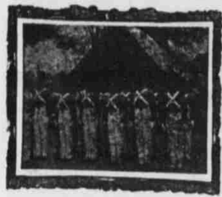
GUARD MOUNT AT WEST POINT.

The United States Military Academy at West Point has long enjoyed an international reputation as the finest training institution in the world, and this prestige will be considerably enhanced upon the completion of the large scheme of improvements now under way and upon which Congress will expend more than seven million