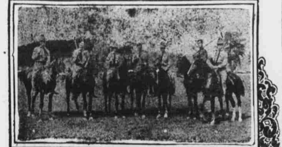
The Cadets Become Expert Polo Players and Swordsmen.

and Utah, where petrified wood occurs in great quantities, yet the region known as the "Petrified Forest of Arizona" is most notable, and is properly classed among the natural wonders of America. In the first place, it is much more ancient than the petrified forests of the Yellowstone National Park, and of certain parts of Wyoming and California, the difference in their antiquity as geologists count being millions of years, and secondly, there is no other petrified forest in which the wood assumes so many varied and wondrous forms and colors. The solidified wood in this mineral state places, the logs and blocks among the gems of precious