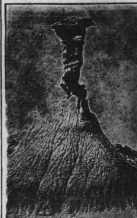
PETRIFIED SENTINEL OF THE MESA.

Among the color seen are every conceivable shade of black, red, white,