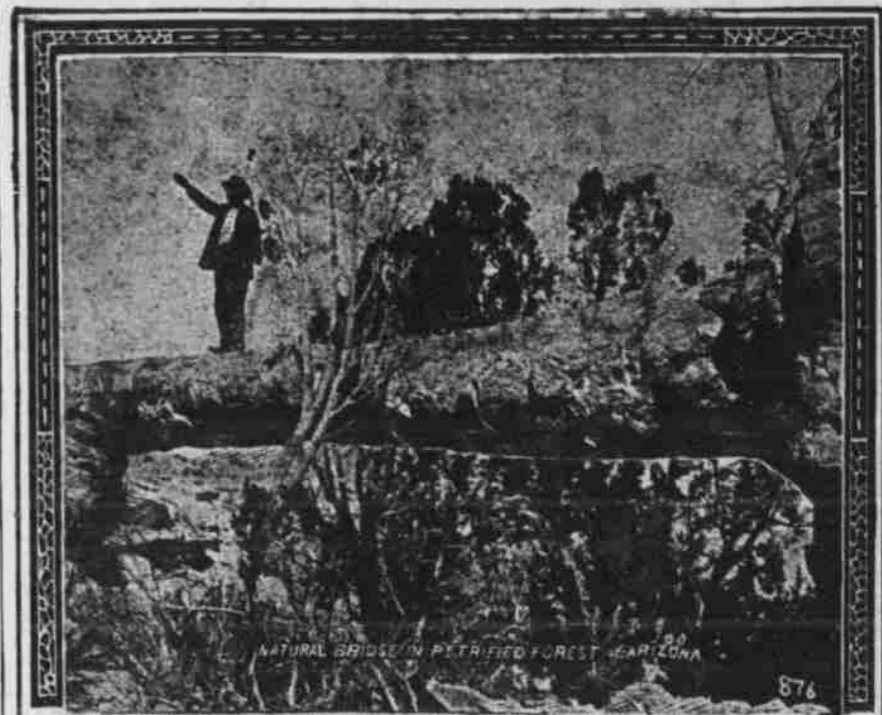
NATURAL BRIDGE IN PETRIFIED FOREST, ARIZONA.

In the past few years the log has begun to show signs of yielding to that peculiar inclination of all petrified trees to crack up into immense pieces; in fact, in several places traverse cracks have already appeared. The Government, in order to preserve