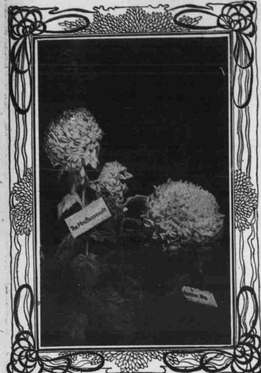
THE TWO STAR CHRYSANTHEMUMS. The Mrs. Roosevelt, A Yellow Beauty 10 Inches Across, and the Beatrice May, A Dazzling White Ball.

four feet tall in which grew eighteen different and distinct varieties, some white, some yellow, while others were pink, brown and red. This was obtained by grafting stems from valuable sorts on a good stock. The first chrysanthemum known to florists was yellow and was grown in Japan. It was carried over to China and from that country rapidly spread all over the world. The passing years however, wrought wonders, and the chrysanthemum, the "autumn queen,"