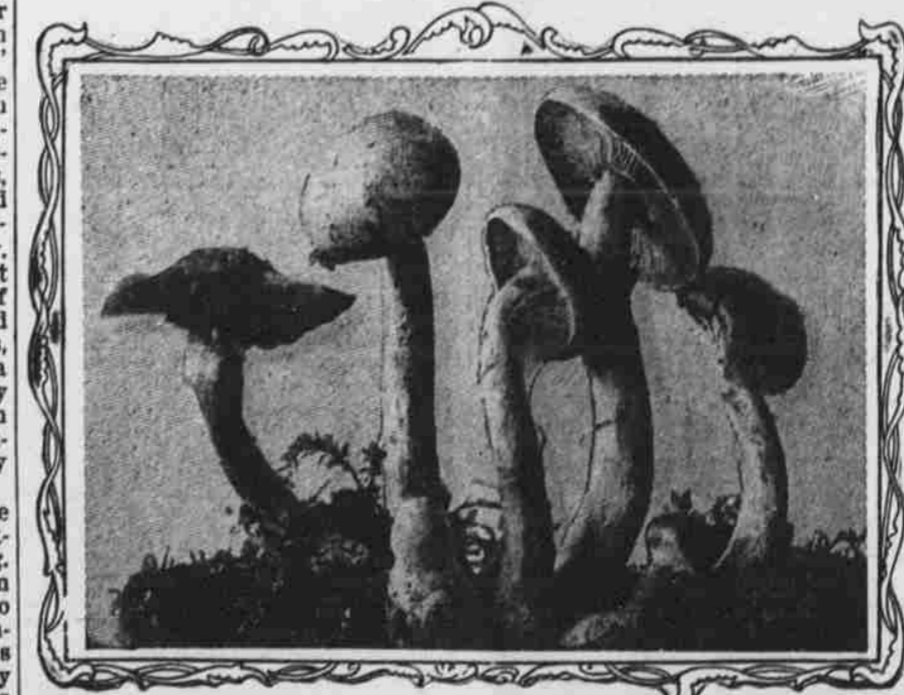
A FAMILY OF EDIBLE MUSHROOMS.

There are several large institutions for the care of the indigent aged. Some of these are free and others a small charge is made for board and lodging. At Issy, near Paris, is an institution for widowers, widows, or married couples, of whom both are over sixty-five years of age and who have been married at least fifteen years. There are many small institutions founded by private persons for old officials, at some of which the charge