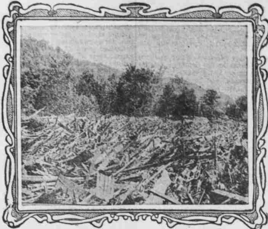
DEBRIS FROM FLOODS ON NOLICHUCKY RIVER, MAY 21, 1901. This mass consisted of the wreck of farmhouses, furniture, bridges, cattle and probably several human bodies, and covered 16 acres of fertile farmland near Ewin, Tenn. The Southern Appalachian region is one of the most exceedingly fertile in the world. The preservation of the forests on the mountain slopes will maintain the flood damage.

embraces the highest peaks and largest mountain masses east of the Rockies. It is the great physiographic feature of the eastern half of the continent, and no other such lofty mountains are covered with hard-wood forests in all North America.