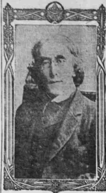
SIR HENRY IRVING

England's tribute to Henry Irving was worthy of his great powers and his great performances. It was recalled, too, with appropriate feelings, that he had made great sacrifices for his high ideals. He spent large sums in an effort to keep his London theater up to a lofty standard, but the times would not sustain him, and in his old age he was forced to take to