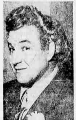
DEAD AT 48—Gorgeous George, shown here in 1949 photo, died in Los Angeles Thursday of an apparent heart attack. He was 48. The golden-haired wrestler hippodromed his way to a fortune with zany antics in the ring.