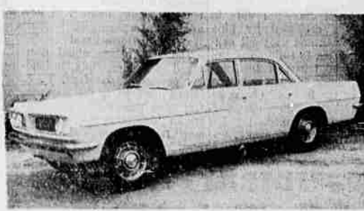
Brand new! With custom interior, power steering, R&H, light blue.