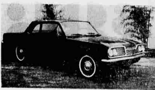
R&H, auto. trans., white wall tires, beautiful maroon, low mileage, 4 cyl. economy car.