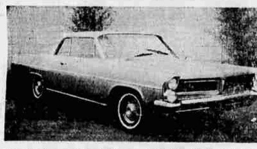
Tilt steering, power steering and brakes, white wall tires, low mileage, one owner. We have 2 to choose from.