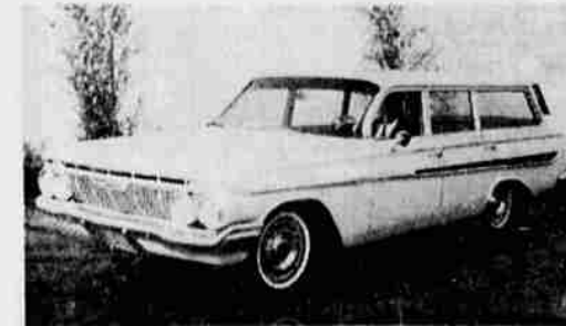
Auto. trans., power steering and brakes, R&H, a real sharp white, one owner and low mileage for a '61.