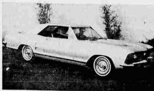
Bucket seat, power steering, power brakes, console shift, silver mist gray, 17,000 miles, one owner.