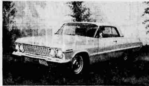
Smart looking, white with red interior, auto. trans., R&H, new tires, low mileage.