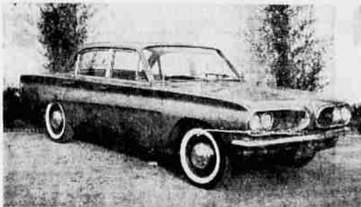
4 Cylinder, automatic transmission, gleaming red, white wall tires.