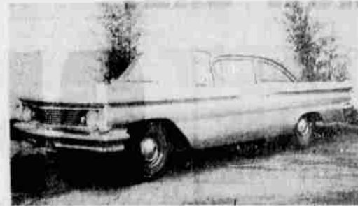
R&H, priced special for our big year end clearance.