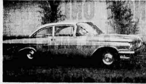
Auto. trans., a sharp clean car priced to sell right.