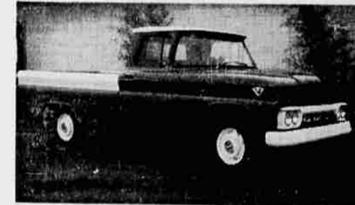
2-Tone blue and white, long wheel base, wide box. BRAND NEW! We are ready to make a deal on this.