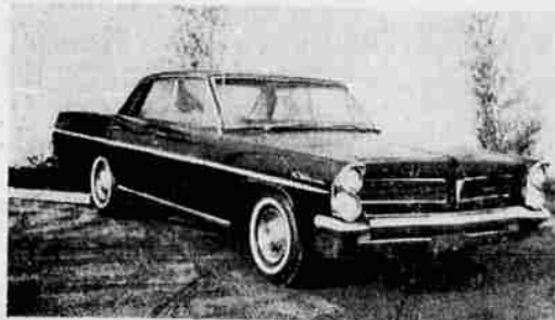
Jet black, leatherette trim, tilt steering wheel, power steering and brakes. Brand new!