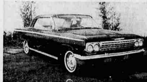
Jet black, bucket seat, R&H, power steering, low mileage, a real sharp car.