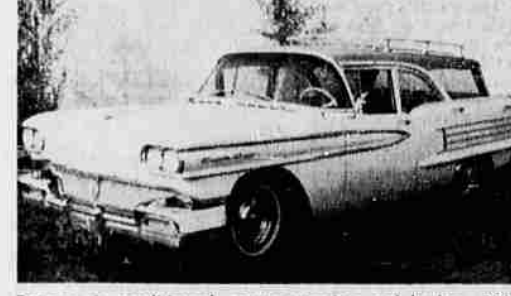
Factory air conditioned, power steering and brakes, R&H, luggage rack, low mileage, one local owner.