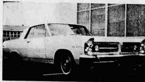
Bucket seats, console shift, 3 carbs., power steering and brakes, local owned, low mileage.