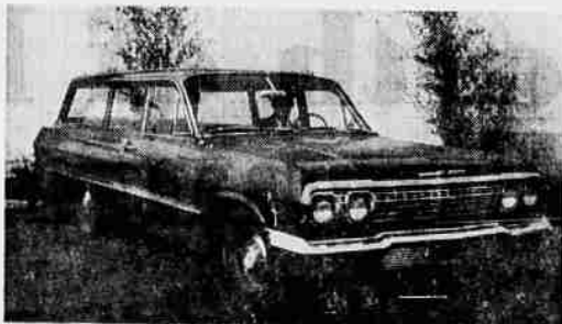
9-Passenger, R&H, power steering, flashing red color.