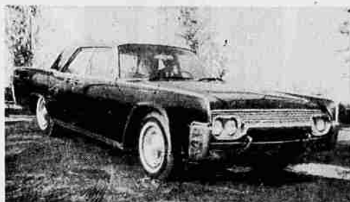
Full power, leather seats, beautiful jet black, premium tires, air condition.