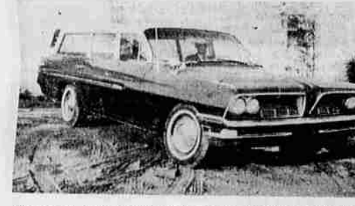
Electric tail gate, electric seats, power steering and brakes, R&H, auto. trans.