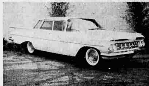
Auto. trans., R&H, white, priced below the market for clearance.