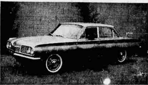
Leatherette trim, 4 cyl., an economy car for the thrifty at heart.