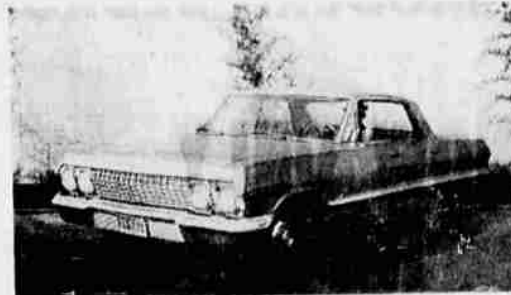
Auto. trans., power steering, R&H, aqua, low mileage, one owner.