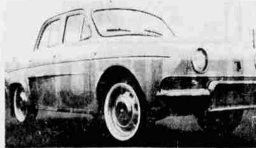
Brand new, 4-dr. sedn., the French economy car, make an ideal 2nd car.