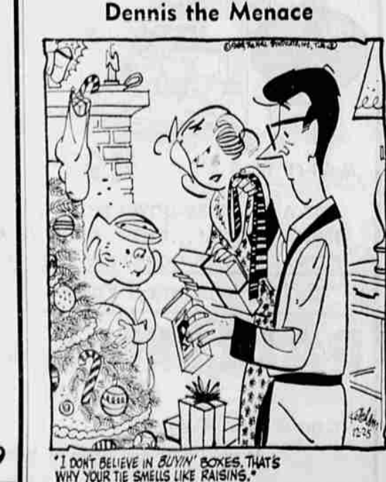
"I DON'T BELIEVE IN BUYIN' BOXES. THAT'S WHY YOUR TIE SMELLS LIKE RAISINS."

NORGE Golden Heart 13.5 CU. FT. REFRIGERATOR-FREEZER $339 95 With Trade Less With Your Lucky Snowball