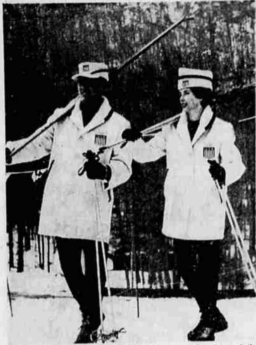
Shown above are the outfits that the men and women of the United States Winter Olympics team will wear in the opening parade of the 1964 games. The IX Winter Olympic Games will be held in Innsbruck, Austria, January 29 to February 4. The smartly styled great coats, lined in Acrilan acrylic fiber, provide brightness, lightness and warmth. Knitted ribbing at the collars and pockets are in alternating stripes of red, white and blue. The same type ribknits are used on the headgear and can be worn over the ears as the weather dictates. The stretch ski pants, in navy blue to complement the coats, provide a trim appearance and eliminate any binding.