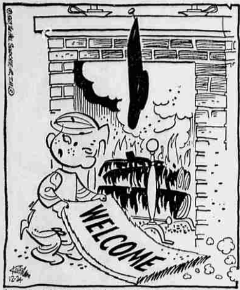
"BUT, MOM! SANTA CLAUS DON'T COME IN THE FRONT DOOR!"