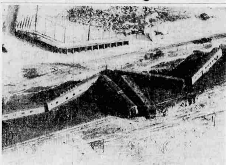
BROKEN RAIL BLAMED — The streamer "City of Los Angeles" was derailed near Coon Rapids, Iowa, when it apparently hit a broken rail. About 25 persons were injured when 16 of the 19 cars spilled off the tracks. Three of the cars overturned.

"Expanding fruit production in South America, Africa and other areas does not necessarily mean competition for our own great fruit growing districts since the harvesting season is in January and February in the southern hemisphere. However, there are benefits in having Northwest firms that manufacture equipment and packing supplies participate in this added foreign business," Meyer disclosed. "Development and manufacturing costs of equipment and supplies used here at home are kept lower by the added volume and profits from foreign sales generally are pumped back into our own economy."