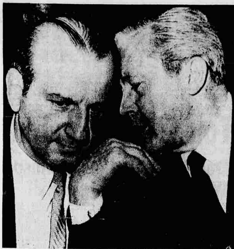
HEARING POSTPONED — Jack Ruby, left, and his lawyer, Melvin Belli of San Francisco, are shown during Ruby's bond hearing in Dallas, Texas. Ruby's hearing was postponed until Jan. 10. He has been charged with the murder of Lee Harvey Oswald, accused assassin of President John F. Kennedy.