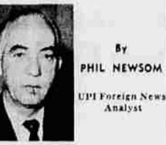
Notes from the foreign news cables:

Not Kidding: French officials say President Charles de Gaulle is in deadly earnest about his Dec. 31 deadline for a Common market farm policy agreement. If none is reached by Christmas he will call a cabinet meeting Dec. 27 to get the green light for his next move. This is likely to be a freeze on any further progress toward completing The Common Market. French ministers also may boycott Common Market meetings. It is just conceivable De Gaulle might decide on a complete walkout.