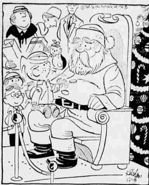
"...AN' I'LL LEAVE A PLATE O' SANDWICHES ON THE KITCHEN TABLE, 'CAUSE I CAN SEE 'YOU'RE A BIG EATER."