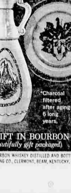
THE CHOICE GIFT IN BOURBON at no extra cost (beautifully gift packaged)