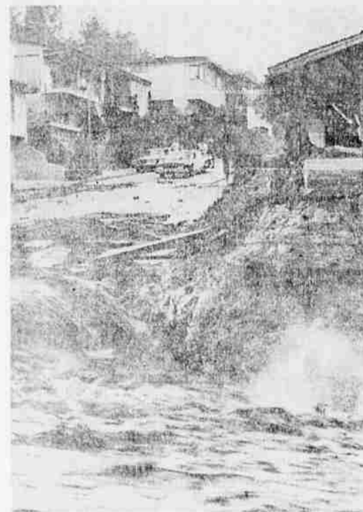
CASCADING WATER — Fast moving water cascades down this Baldwin Hills street after a reservoir dam burst and sent almost 300 million gallons of water into the area. At least three persons were known to be dead and many homes were destroyed. At one spot the torrent of water and mud swirling over the area was 12 feet deep.