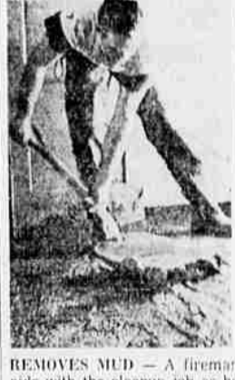
REMOVES MUD — A fireman aids with the cleanup job as he shovels mud from the front door of a home in the Baldwin Hills area of Los Angeles.