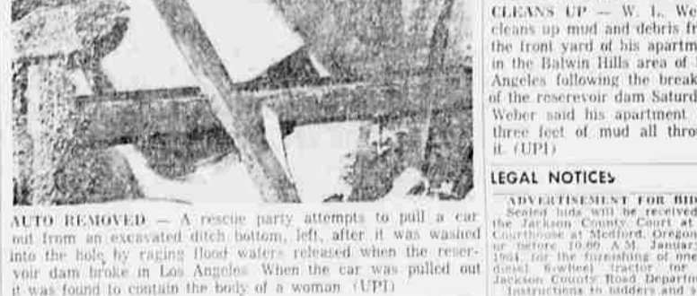
AUTO REMOVED — A rescue party attempts to pull a car out from an excavated ditch bottom, left, after it was washed into the hole by raging flood waters released when the reservoir dam broke in Los Angeles. When the car was pulled out it was found to contain the body of a woman.