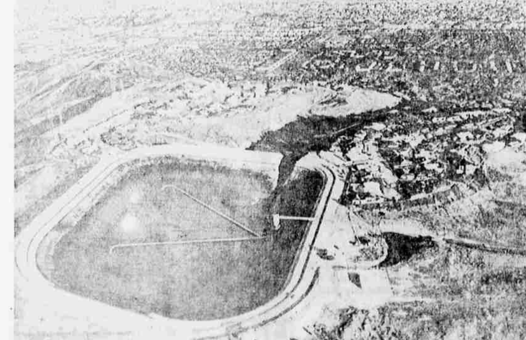
AIR VIEW SHOWS BREAK — The break in the Baldwin Hills reservoir dam shows plainly in this aerial view. To the right of the break is the river of mud left by the water. Three persons are known dead and at least 60 homes were destroyed by the waters. Property damage is estimated to be $16 million.