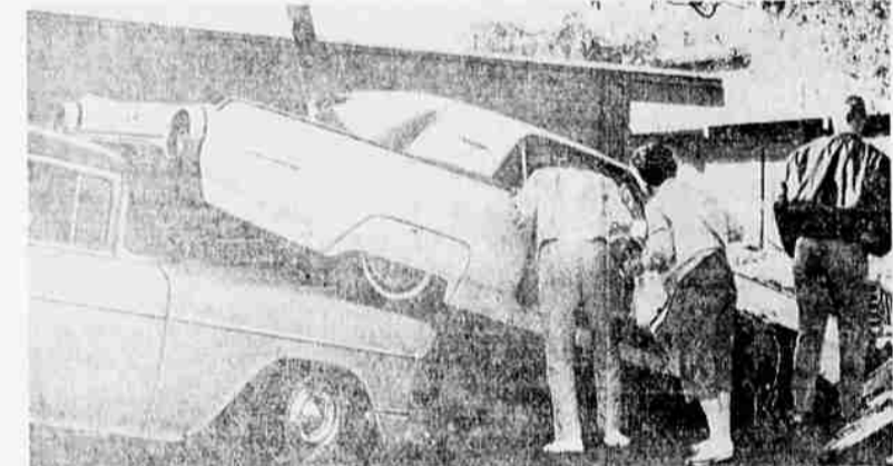
WRECKED CAR INSPECTED — Unhappy owners of the car in the center inspect their wrecked vehicle after the Baldwin Hills flood. Cars were thrown about like toys as the waters came cascading down the hillside.