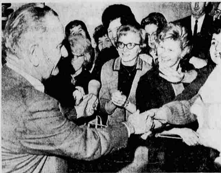
JOHNSON GREETED —President Johnson is greeted enthusiastically by female employees after his arrival at the Pentagon. The Chief Executive went to the Pentagon for a luncheon and briefing.