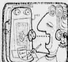
ORDER BY PHONE