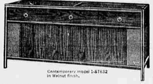
Contemporary model 1-ST632 In Walnut finish.

Magnavox is beautiful to see... more beautiful to hear! $298.50