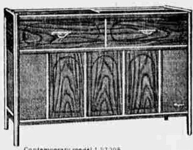
Contemporary model 1-ST295 In Walnut finish.

ONLY THE ADVANCED MAGNAVOX ACOUSTICAL SYSTEM—projects sound from both the cabinet sides and front to extend stereo separation far beyond the space between the speakers—to the very width of your room. Features: Four speakers include two 12" bass woofers, powerful stereo amplifier, Micromatic Record Player, Stereo FM plus FM/AM Radio.