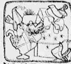
WE GIFT WRAP