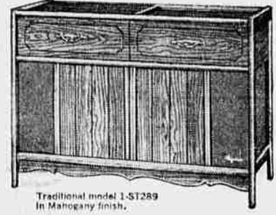
Traditional model 1-ST289 In Mahogany finish.

YOUR RECORDS CAN LAST A LIFETIME! The fabulous Micro-matic Player, in all models, banishes record and stylus wear. The Diamond Stylus is Guaranteed 10 Years. Other features: Four high fidelity speakers, powerful stereo amplifier, Stereo FM plus FM/AM Radio. Also available in Contemporary and Colonial styles.