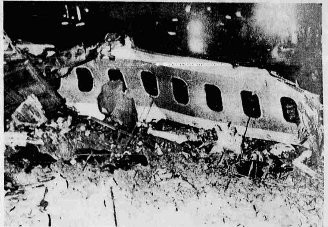
WRECKAGE DEBRIS — This six-window section of fuselage was the largest piece of wreckage left after the crash of a Pan-American 707 crash in Elkton, Md.