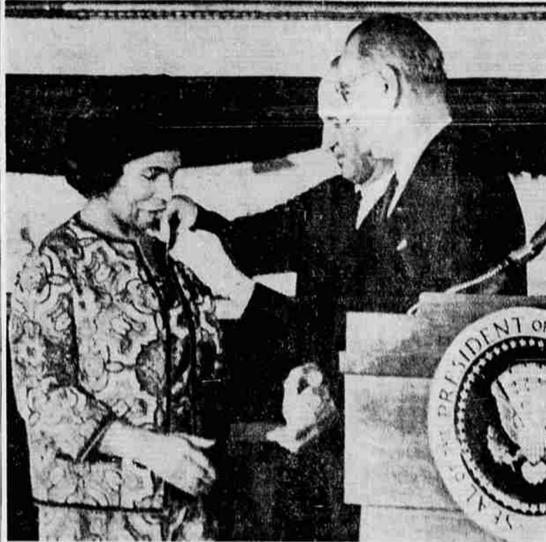
MEDAL OF FREEDOM—President Johnson confers the Presidential Medal of Freedom on singer Marian Anderson (L) in a ceremony at the White House today. Pinning the medal on the singer is Angier Biddle Duke, U.S. Protocol chief. America's highest peacetime award was conferred on 31 men and women at the ceremony.

Our Skies Tonight Sunset today 4:39 p.m. Sunrise tomorrow 7:27 a.m. Moonrise tonight 11:03 p.m. Last Quarter Dec. 7 The cluster of dim stars seen in the east tonight at 8:45 p.m. is the Pleiades. In April we will see Venus near the Pleiades.