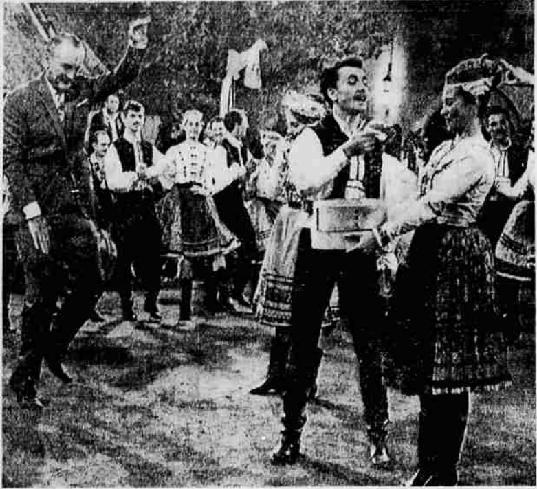
DANCE IN BUDAPEST — U. S. actor, George Sanders, noted for his suave and debonair film roles, practices folk dance, Csardas, with members of Szentendre Folk Dancers during break in film chores.